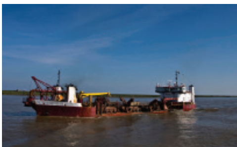
MANY TYPES OF SALTWATER APPLICATIONS